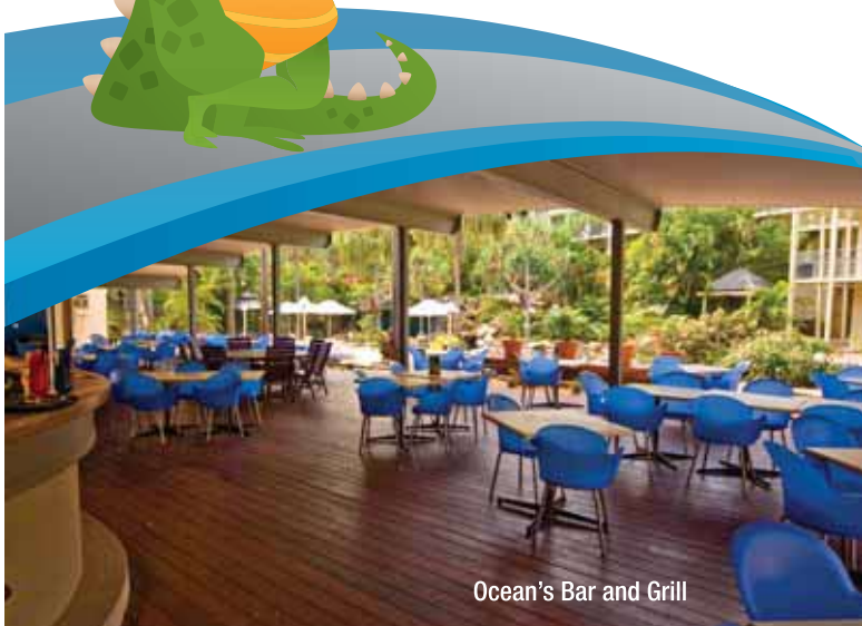
Ocean's Bar and Grill